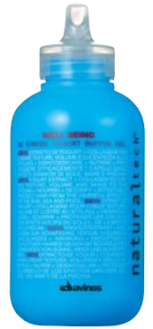
WELL-BEING DE STRESS YOGURT BUFFER GEL

TO PROTECT HAIR FROM CHLORINE, SALTNES AND SMOG. PH 5.5