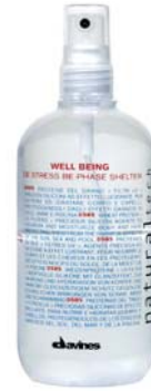
WELL-BEING DE STRESS BE-PHASE SHELTER

EXCELLENT TREATMENT TO PROTECT HAIR EXPOSED TO ENVIRONMENTAL STRESS. SUITABLE AS DETANGLER AND LIGHT CONDITIONER. PH 5.5