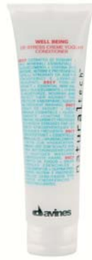
WELL-BEING DE STRESS CONDITIONER

FOR A DAILY USE MAINLY DURING SUMMER OR IN A VERY HOT CLIMATE. PH 5.5