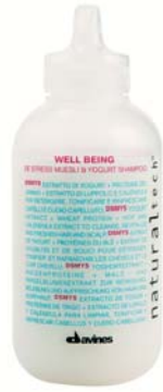
WELL-BEING DE STRESS SHAMPOO

DELICATE CLEANSER RICH IN MINERAL SALTS AND VITAMINS FOR EACH TYPE OF HAIR.